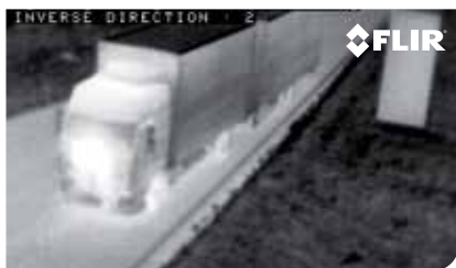
Inverse direction detection