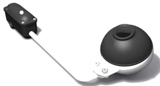
TrafiCam C-Walk is an above-ground sensor for pedestrian detection.