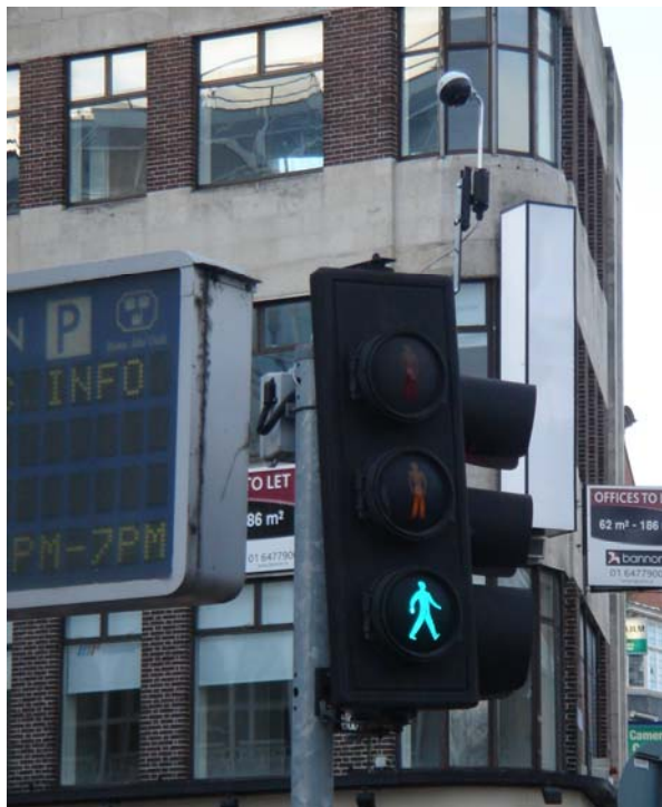
At zebra crossings, TrafiCam C-Walk can increase safety and efficiency for both pedestrians and drivers.

TrafiCam C-Walk is an integrated camera and detector offering pedestrian presence detection at signalized intersection and mid-block crossings.