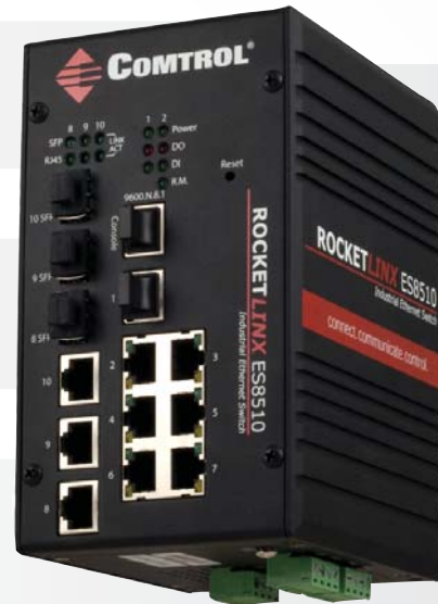
Part Number 32061-6